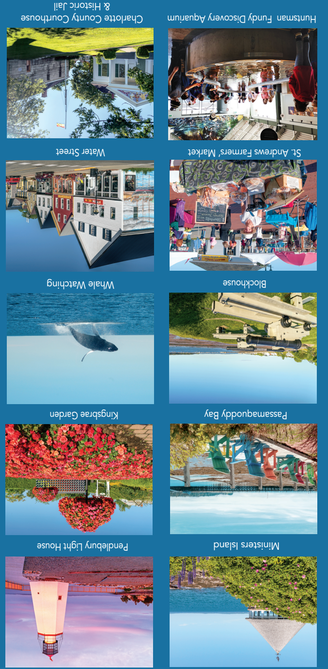
Charlotte County Courthouse & Historic Jail

St. Andrews Trade Dollars from previous and current years are available and can be purchased for $5 at Serendipin' Art, The Macklem House, The Whale Store, and the St. Andrews Chamber of Commerce.